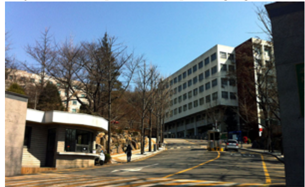
Chongshin University, my seminary home from 1994-1996

So how do you think students feel about this university culture of power and privilege given to professors? In my limited (i.e. unempirical and completely made-up) observations, I sometimes think about how students actually benefit from such clearly defined distinctions between professor and student. When I was a theology student in Seoul in 1994-1996, I spoke up in class exactly zero times. My fellow seminarians and I accepted that a professor’s place was to lecture, assign readings and grade, whereas the students had to listen, read and study. Learning flowed in only one direction, from the powerful and respected professor to the student. I was a TA for all three years and duties included mopping the floor and preparing the office heater. There was no such thing as an end-of-year course evaluation of the professor. But none of us complained. Most of us didn’t know anything different.