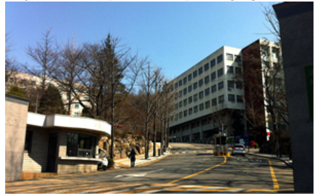
Chongshin University, my seminary home from 1994-1996

So how do you think students feel about this university culture of power and privilege given to professors? In my limited (i.e. unempirical and completely made-up) observations, I sometimes think about how students actually benefit from such clearly defined distinctions between professor and student. When I was a theology student in Seoul in 1994-1996, I spoke up in class exactly zero times. My fellow seminarians and I accepted that a professor’s place was to lecture, assign readings and grade, whereas the students had to listen, read and study. Learning flowed in only one direction, from the powerful and respected professor to the student. I was a TA for all three years and duties included mopping the floor and preparing the office heater. There was no such thing as an end-of-year course evaluation of the professor. But none of us complained. Most of us didn’t know anything different.