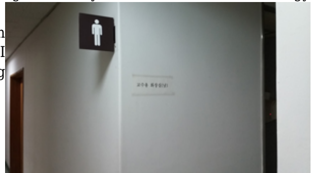
I'm not sure if the Association of Theological Schools would approve of this sign.

just like the restrooms on any seminary campus in America. But as I approached the men's room, I saw a paper sign taped to the wall, identifying the restroom as "for professor usage (male)".