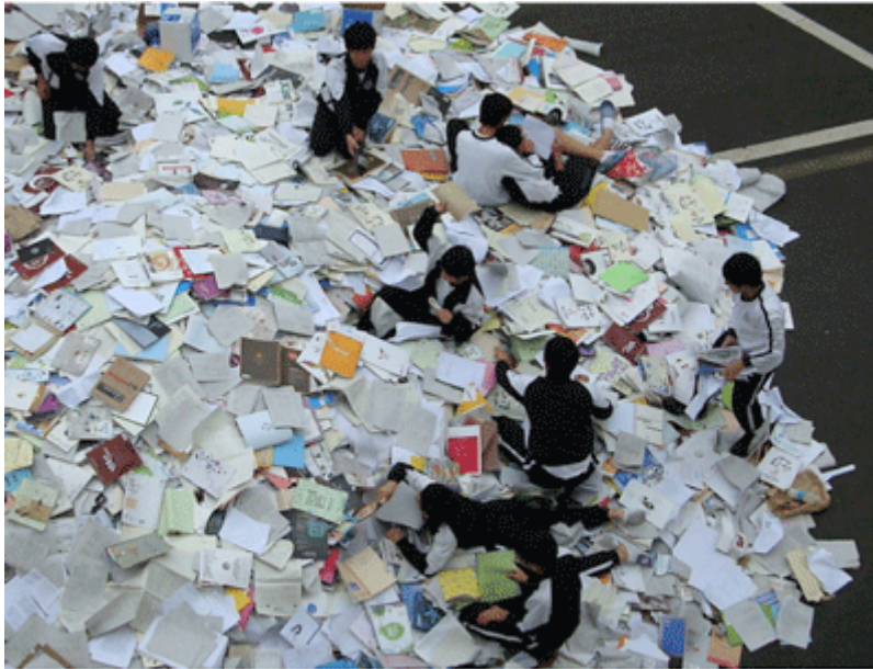
The day after the exam, students celebrate by tossing their notes and playing on the pile.

The test takes roughly nine hours. For the American equivalent, imagine yourself as a high school senior taking the SAT. As soon as you finish the three-hour exam, you immediately take another version of the ENTIRE TEST an additional two times.