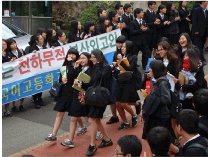
Underclass Students Cheer the Seniors on the Day before the Big Exam.