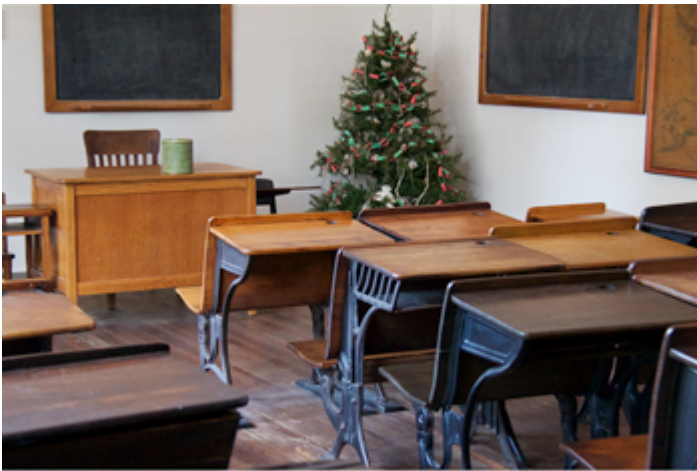
"Christmas Vacation"

The Christmas season is still a break of sorts, at least from the front of the classroom. My Facebook feed lights up with laments about plagiarism and students who appear not to have listened to a word we spoke or even bothered to read the syllabus. It then lights up again with shouts of acclamation, both when students do well and learn something along the way but also when the grades are finally in and the fall semester has drawn to a close. During these times of grading and lament, the Twitter handle @BibleStdntsSay ( https://twitter.com/biblestdntssay ) helps provide some levity and reminds me that I'm not alone.