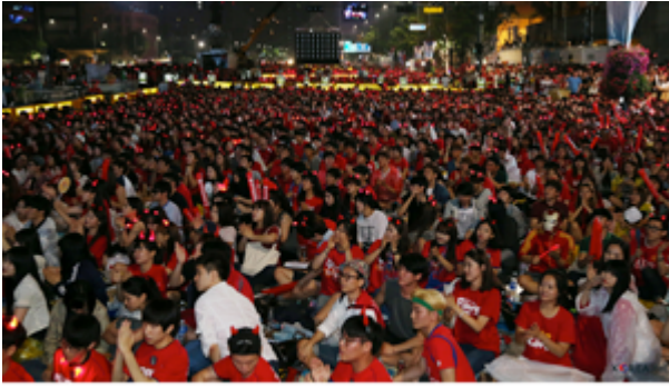
Koreans are particularly non-diverse when it comes to watching the FIFA World Cup.

This lack of diversity did not seem so strange to me, as Korean society was, and still is, very homogenous. Koreans place a strong value on uniformity and harmony. But on a recent visit to my alma mater in Seoul, this lack of diversity was particularly striking to me. What does a seminary or religious study department have to lose and gain from such a homogenous student and faculty population?