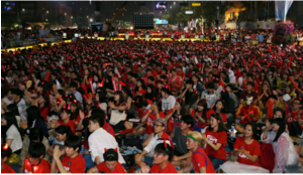
Koreans are particularly non-diverse when it comes to watching the FIFA World Cup.

This lack of diversity did not seem so strange to me, as Korean society was, and still is, very homogenous. Koreans place a strong value on uniformity and harmony. But on a recent visit to my alma mater in Seoul, this lack of diversity was particularly striking to me. What does a seminary or religious study department have to lose and gain from such a homogenous student and faculty population?