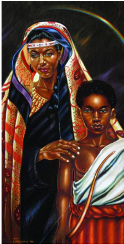
Hagar and Ishmael